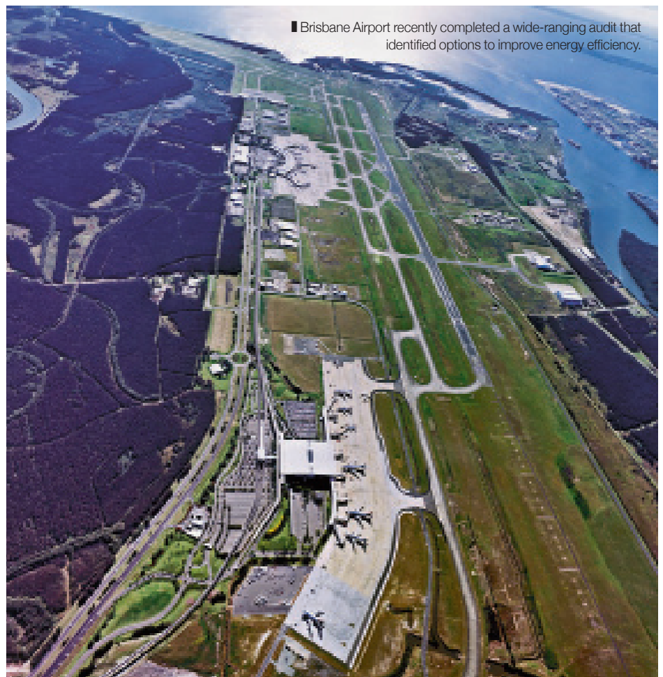
■ Brisbane Airport recently completed a wide-ranging audit that identified options to improve energy efficiency.

At Adelaide Airport, recycled water is used for toilet flushing in the airport terminal, all irrigation is