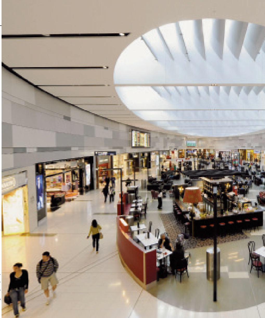
James Morgan/Sydney Airport: 1354877

The overall terminal floor area has increased