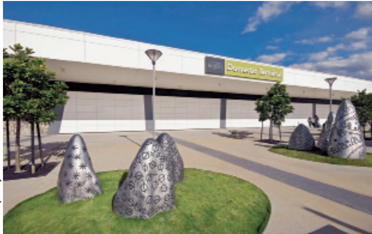
Cairns Airport Pty Ltd: 1354878

In response, Sydney Airport is working with